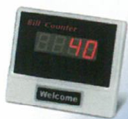
Additional display unit can be purchased for customer convenience.

Machine can be operated on two different modes, auto or manual.